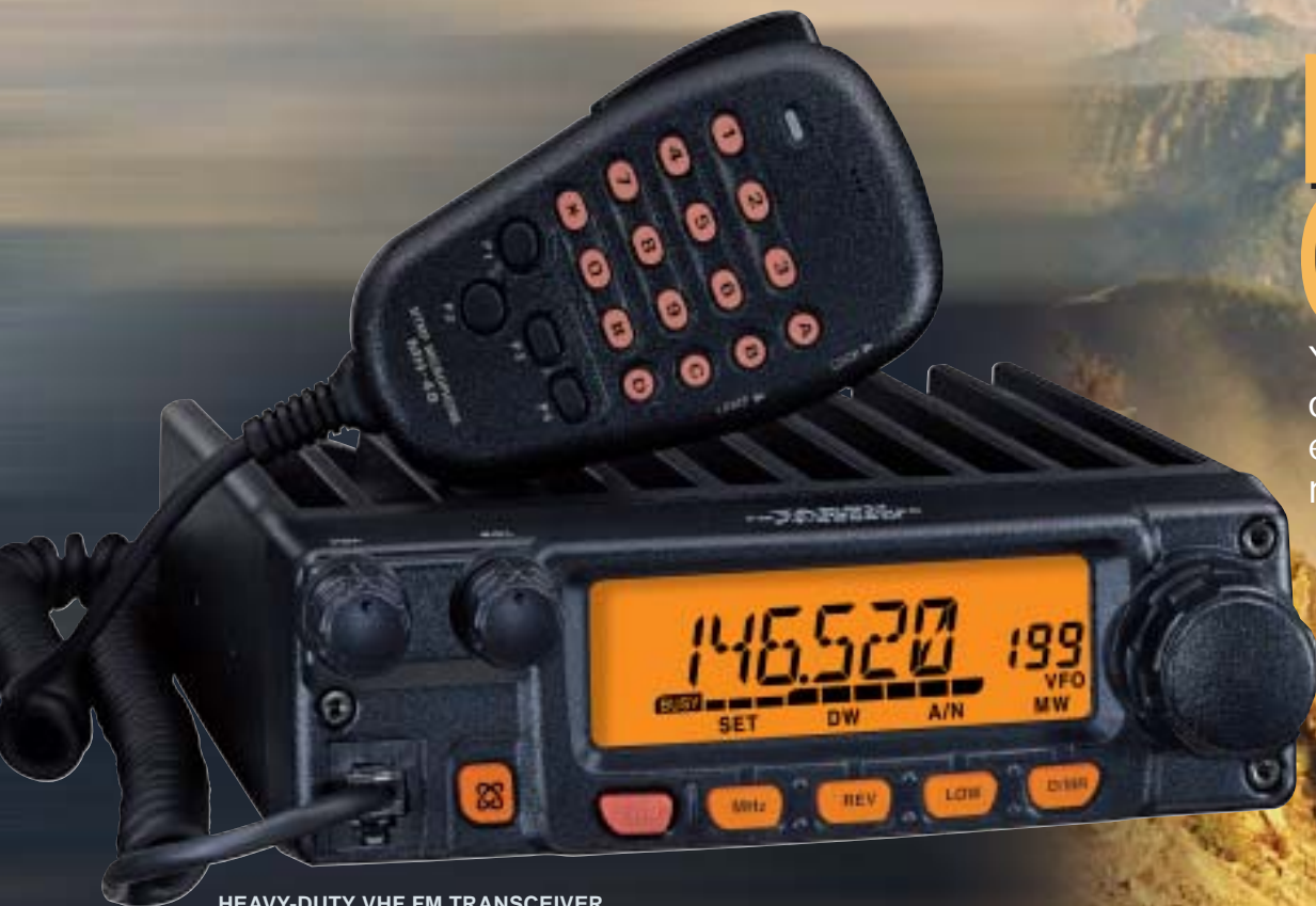
HEAVY-DUTY VHF FM TRANSCEIVER FT-2800M